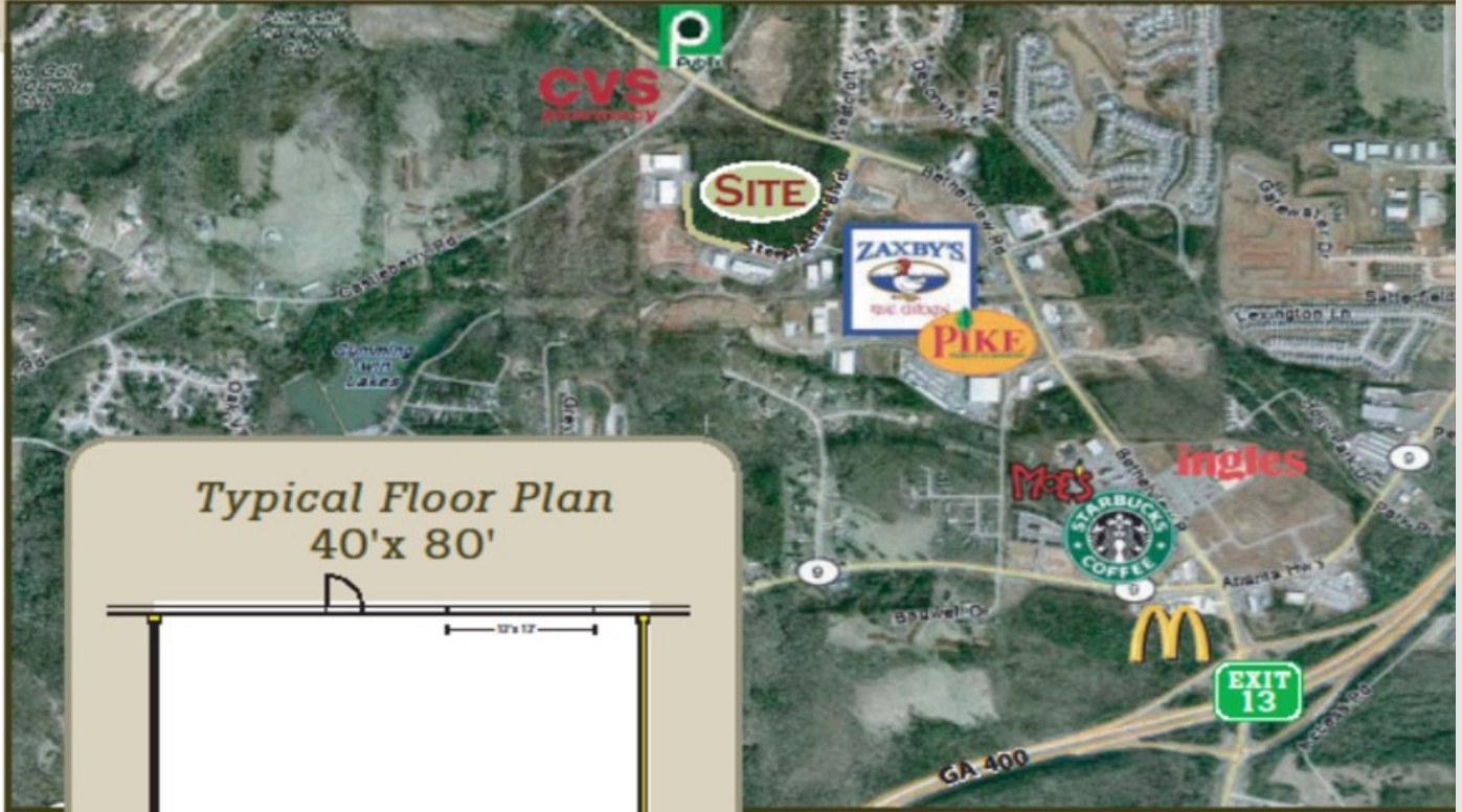
Typical Floor Plan 40'x 80'

5905 STEEPLECHASE BOULEVARD CUMMING, GA 30040